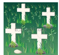
© Cor Stock Photo - cap246166

CEMETERY NEWS: Please do not dump your trash in the cemetery along the fence. This has become a problem in one of our cemeteries where people are dumping trash and it blows onto the graves of others. No one likes to see the graves of their loved ones with trash strewn on top of them. PLEASE TAKE YOUR TRASH WITH YOU. IT IS GREATLY APPRECIATED.