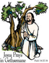
Jesus Prays in Gethsemane Mark 14:32-34